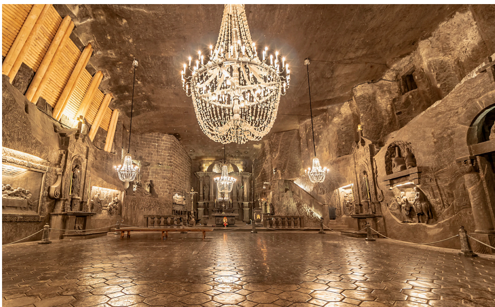
St. Kinga's Chapel in the Wieliczka Salt Mine.