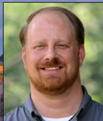
Host of the popular Just A Guy in the Pew Podcast