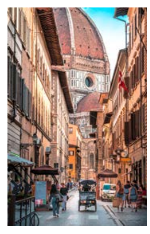
July 31, Sunday - Day 9: FLORENCE

August 1, Monday - Day 10: FLORENCE - DAY AT LEISURE