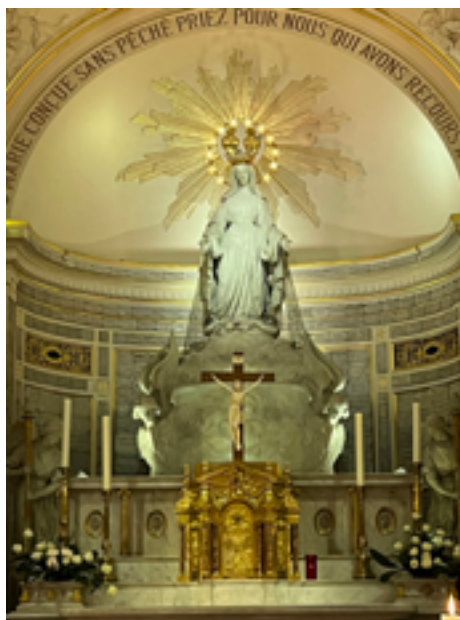
The Chapel of Our Lady of the Miraculous Medal on Rue Du Bac, Paris

*Mass is subject to confirmation based on flight arrival time.