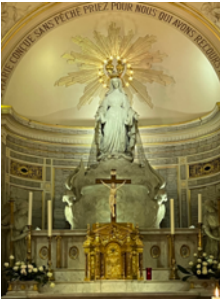
The Chapel of Our Lady of the Miraculous Medal on Rue Du Bac, Paris

Early this morning we arrive in Rouen, where we retrace the footsteps of St. Joan of Arc. Rouen offers a restored medieval quarter and a marvelous Gothic cathedral of Notre Dame, often painted by Claude Monet. Throughout its turbulent history, the city was destroyed several times. During the Middle Ages, it was devastated by fire and the plague. The English occupied it during the Hundred Years War, at which time the French heroine Joan of Arc (Jeanne d'Arc) was tried for heresy and burned at stake in the central square in 1431. During