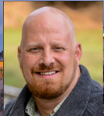
Host of the popular Just A Guy in the Pew Podcast