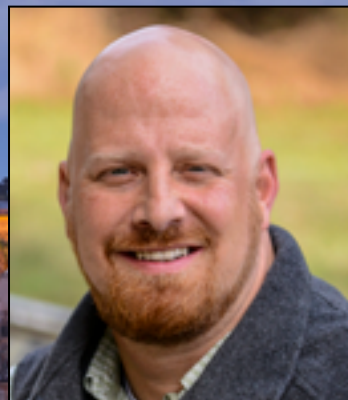
Host of the popular Just A Guy in the Pew Podcast