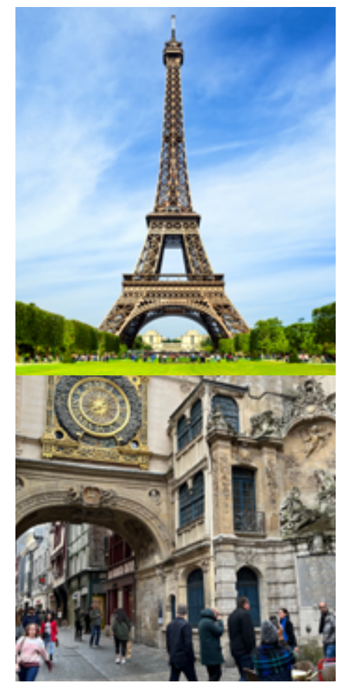
Enroll online to guarantee your spot immediately. You can manage your trip, see your documents and itinerary, and view or pay your invoice, from any computer or mobile device.