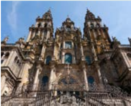
Cathedral of St. James